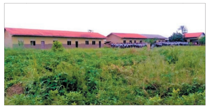
Students in front of our first school buildings ...

Thanks to your faithful support, all the students in our Agro-Veterinary School in Mabala keep receiving their education and training. So far, the Congolese Ministry of Education does not pay any teachers in new secondary schools like ours. However, since