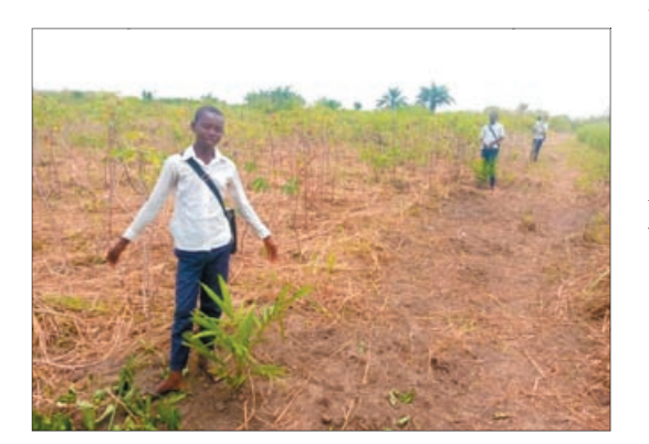
team in the Congo really appreciate all that you do for them.

Thank you once more for all your help and support. Our students, teachers and