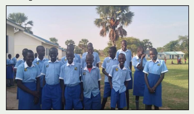
Some of our refugee students at school

That meant that when they joined us, they had almost zero English skills, and they tested academically at grade 2 level, even though they were 15 or 16 years old. Our teachers are used to dealing with extremely disadvantaged youth, so rather than ever put them with the young ones, they've been tutored. Lockdown though, helped us greatly, as we hired an English teacher and when they came back, those who hardly understood a word, are now scoring 4^{th} and 5^{th} in class! It's a real credit to their energetic passion to try to learn!