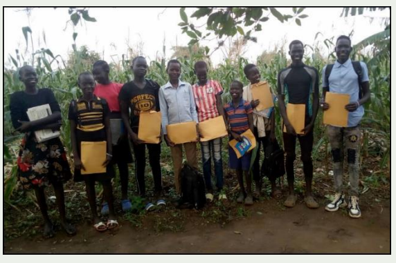
In the camp receiving more study packs