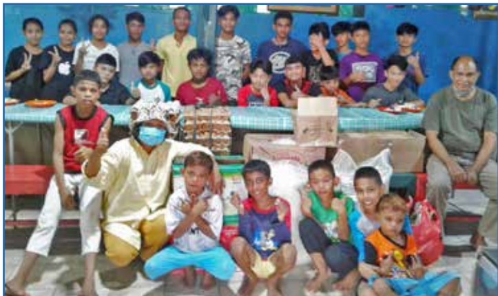
↑ Devine Mercy orphanage

We delivered basic food items to “Devine Mercy” orphanage in Depok and “Emi Kasih Bersinar” orphanage in Pasar Minggu .