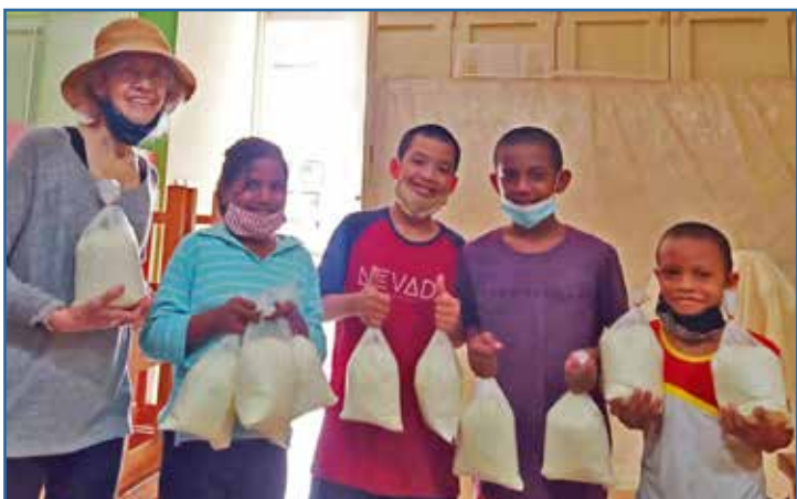
↑ Rumah Kasih Pelangi orphanage in Cimahi which has 15 orphans