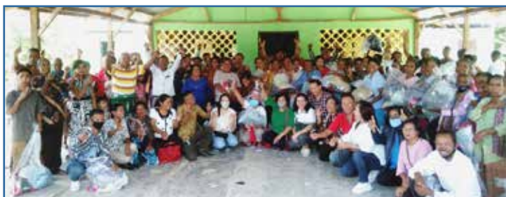
↑ group photo all together in one of the villages