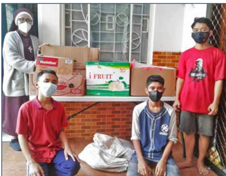
↑ Emi Kasih Bersinar orphanage

Nothing the heart gives away is lost; it's kept in the hearts of others