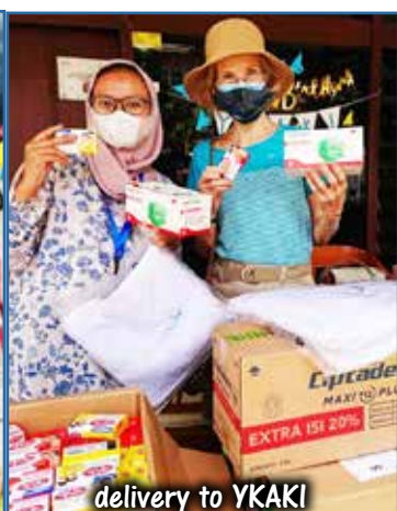
delivery to YKAKI