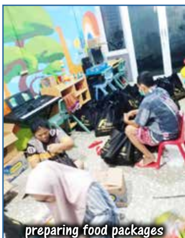
preparing food packages