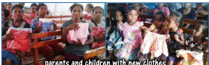
parents and children with new clothes