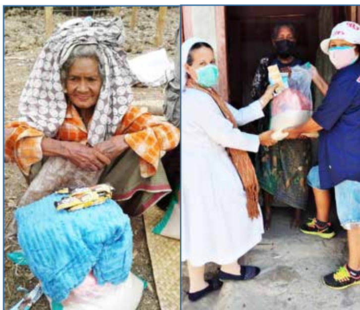
some of the recipients