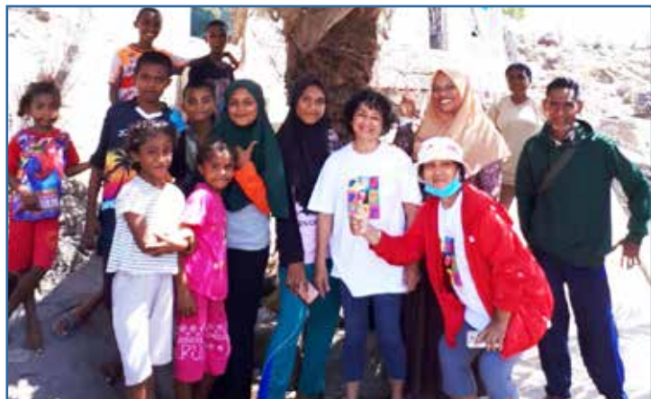
spending time with the local people