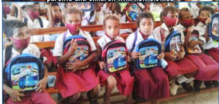
happy children with school bags