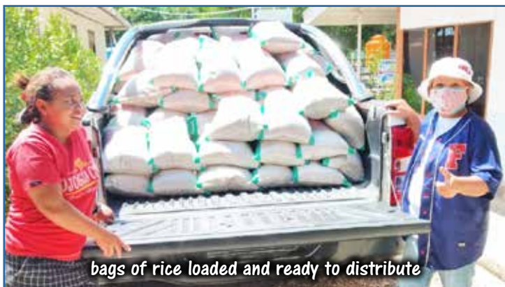
bags of rice loaded and ready to distribute

This month Esther was able to continue our project in Atambua . We have been planning to visit there for quite a while but had to postpone due to Covid restrictions. We had shipped goods from Jakarta months ago so this was a relief to finally go there and deliver the goods to the needy people in this area.