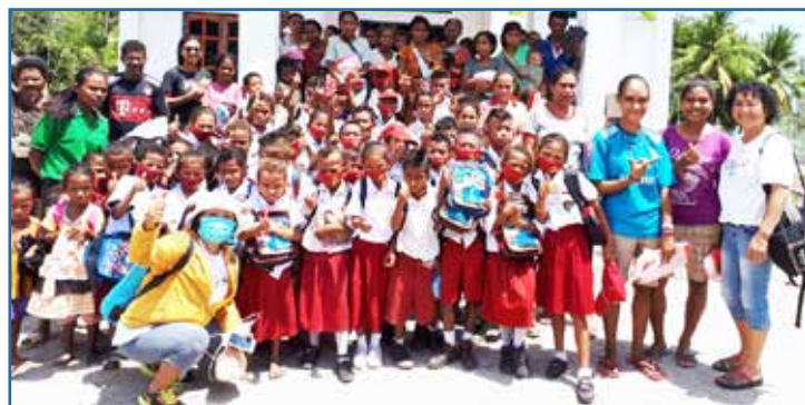
group picture with school children