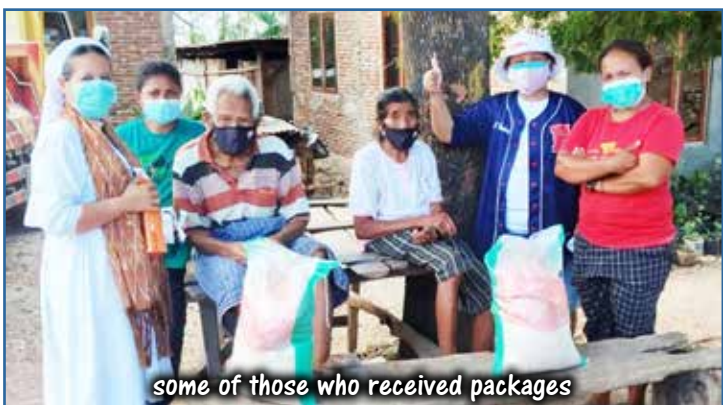
some of those who received packages