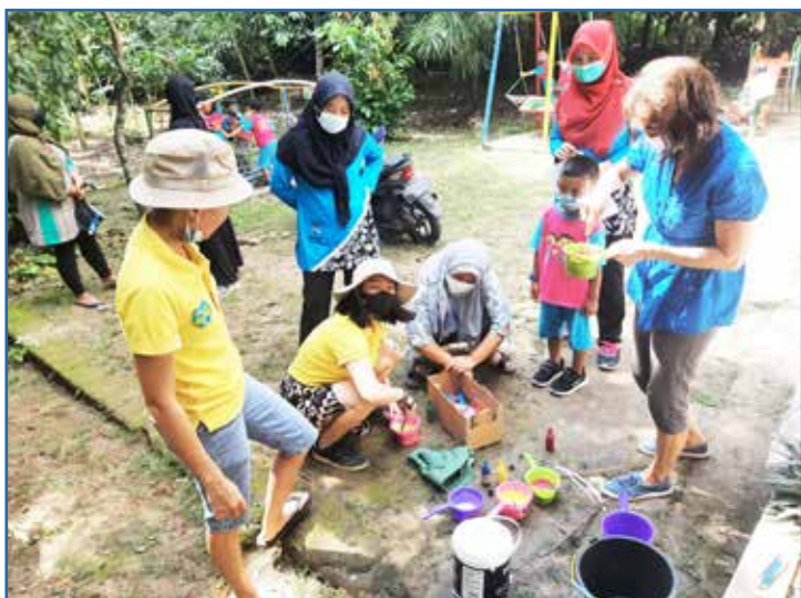
preparing the paint for the mural

4 volunteers travel to Jogja to visit friends and help paint a mural on preschool building. We had a wonderful time at the school spending time with the teachers and children. Thanks to sponsors we were able to give a financial gift to the school for them to buy school equipment and medical needs for the children.