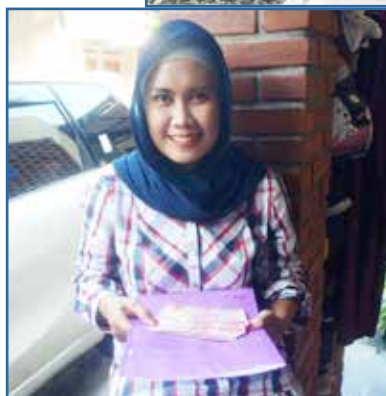
financial gift for the school