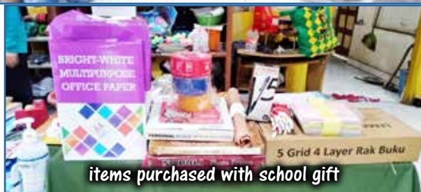
items purchased with school gift