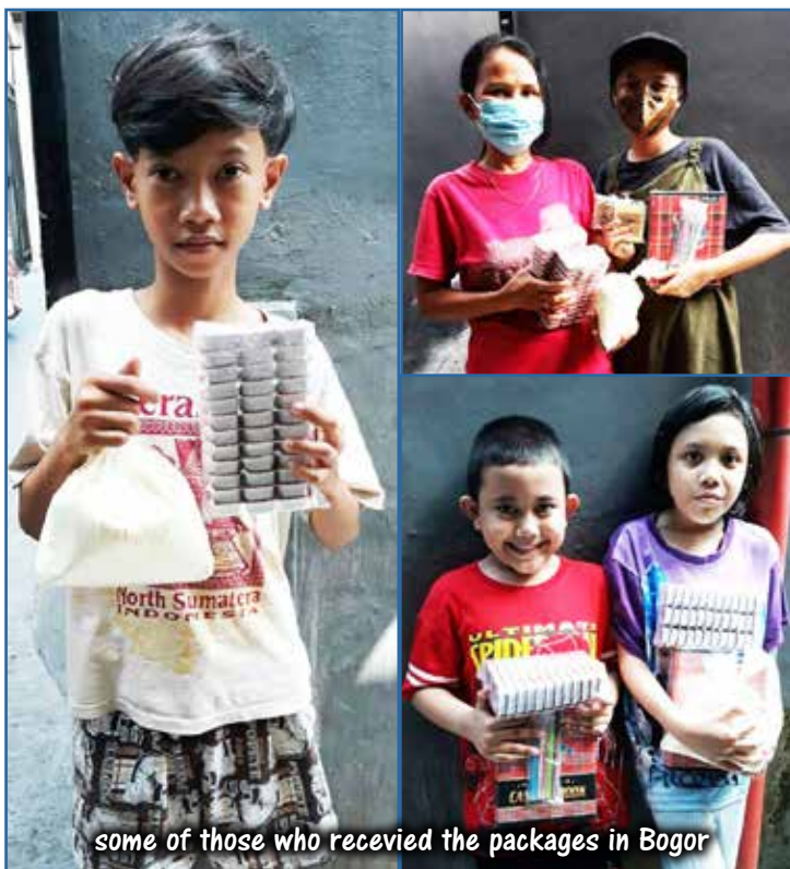
some of those who received the packages in Bogor

She also visited needy families in Bogor to deliver donated milk and jam.