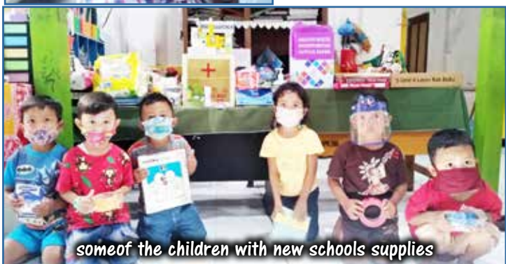
some of the children with new schools supplies