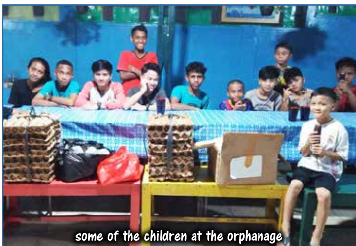
some of the children at the orphanage

She also visited needy families in Bogor to deliver donated milk and jam.