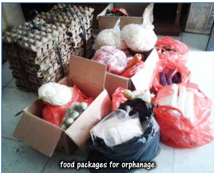
food packages for orphanage

Esther returns again to the Devine Mercy Orphanage in Pamulang to deliver donated food staples.