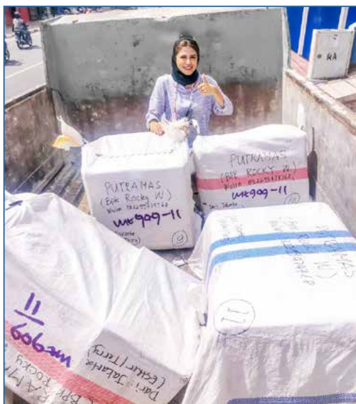
goods that have already arrived in Alor

Together we can make a difference! Donations can be transferred to: