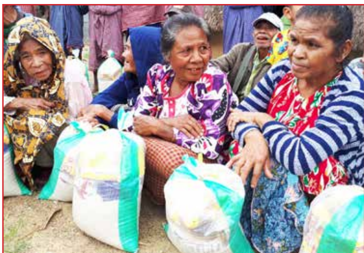
some of the local mothers