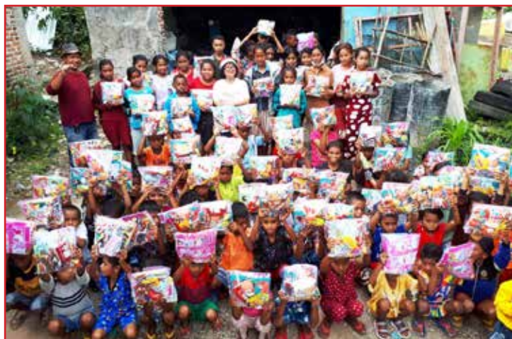
happy children with Christmas gifts