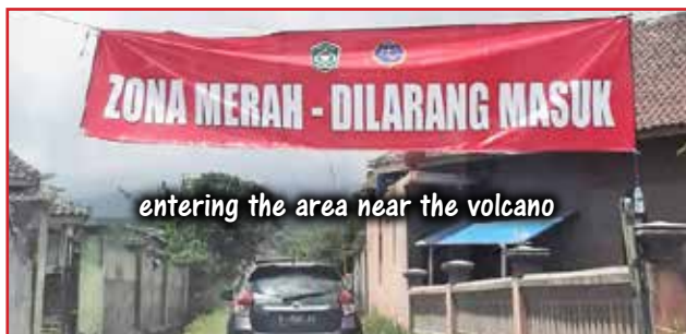
entering the area near the volcano

Our team traveled to Malang, East Java where we made regular daily trips to different areas around Semeru Mountain . We provided 200 packages of goods containing: blankets, mask, hand sanitizer and instant noodles to Lengkong village, Oro Oro Ombo. And 200 blankets to Sumbermujur village, Candipuro.