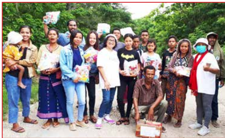
another village with Christmas gifts