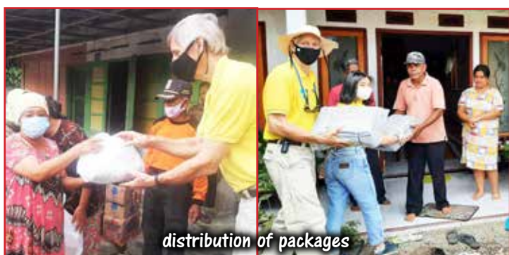
distribution of packages