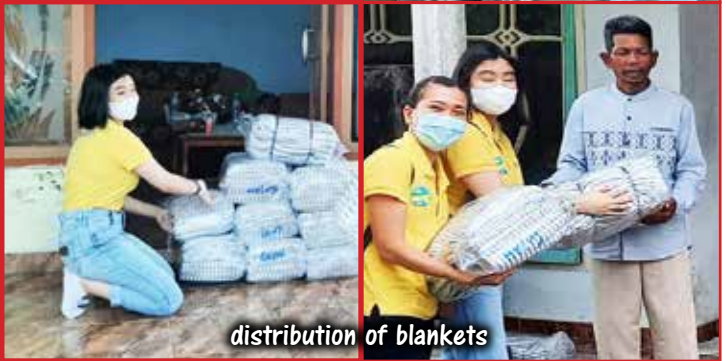
distribution of blankets