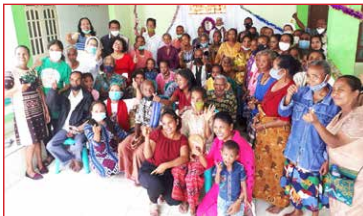
group picture with locals

Team returns to Atambua to distribute blankets Christmas toys, stationary and snacks to needy villages.