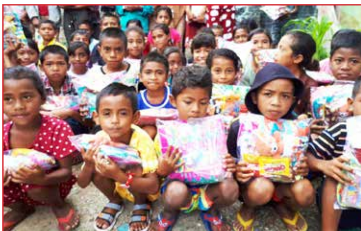
children with gifts

Together we can make a difference! Donations can be transferred to: