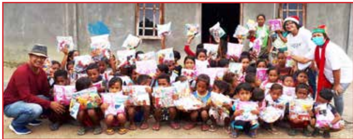
more happy children