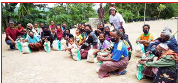
interacting with the locals