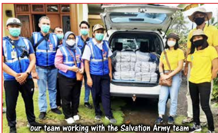
our team working with the Salvation Army team